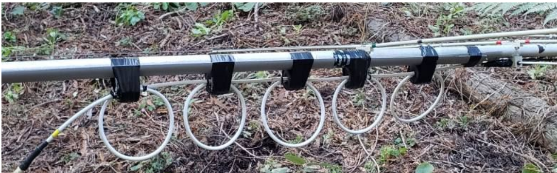
Fig 2 – The chokes mounted to the boom on the ground ready to install.

The coax in the photo is the Teflon version of Commscope 3227, a high quality UHF coax with performance comparable to LMR400, intended for installation in the plenum space in a large data center. The cores are clamped tightly closed to minimize any air gap where their two halves meet; the turns are also held in place on both sides of each core. Most cable ties don't survive UV, so must